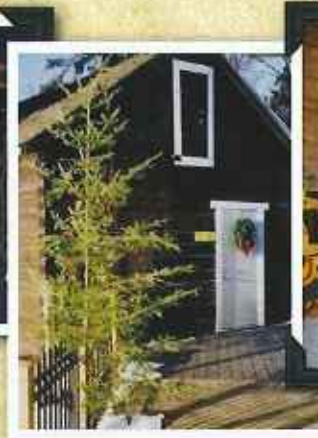
Finnish Log Home