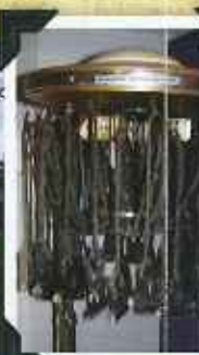
Beauty Shop Artifact