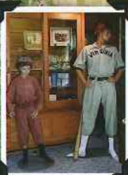
White Pine Logging History

PRESERVING OUR HISTORY... OUR GIFT FOR TOMORROW.